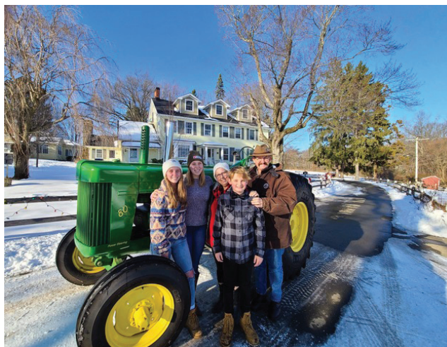
The Alstede Family.