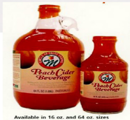
Available in 16 oz. and 64 oz. sizes

Made from fresh New Jersey Peaches "Peach Cider Drink, Peach Salsa, Peach Preserves"