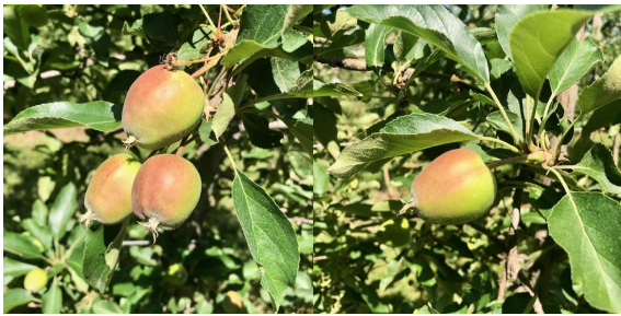
Figure 5. Typical Gala fruitlet clusters after Accede application: untreated control on left, Accede application on right.

by the Accede application(s). This was also observed in an ACC experiment conducted on McIntosh by Greene in 2021 where virtually no thinning occurred too. On Honeycrisp, it's unclear how Accede may work, it may be useful but this remains to be determined.