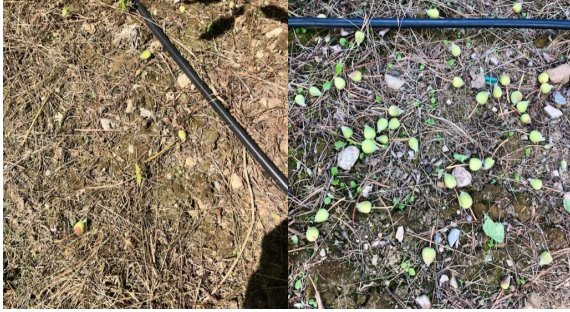
Figure 4. Gala fruitlet drop following Accede application: untreated control on left vs. Accede application on right.