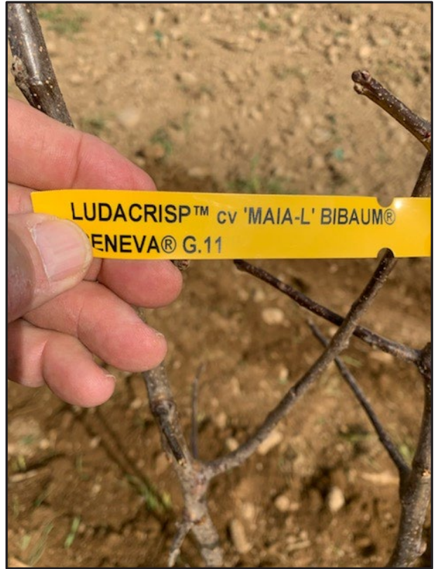
Ludacrisp cv MAIA-L BiBaum (double buded leaders) were planted as well