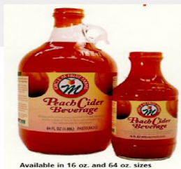
Available in 16 oz. and 64 oz. sizes

Made from fresh New Jersey Peaches "Peach Cider Drink, Peach Salsa, Peach Preserves"