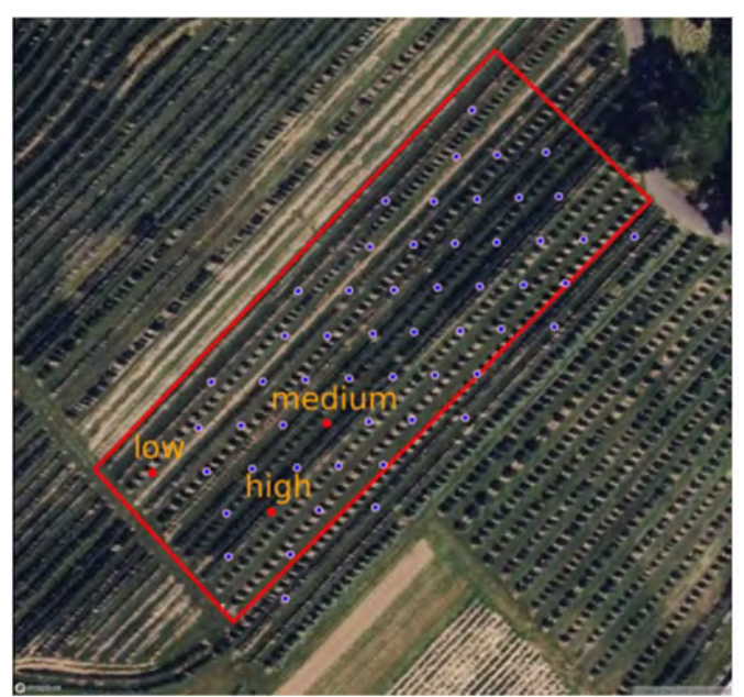
Example of High sample apple tree as seen but the Outfield drone flyover