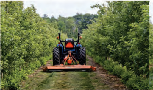
RAS-Rotary Mower. Ideal for mowing orchard rows.