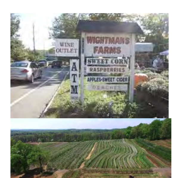
Wightman Farms aerial view