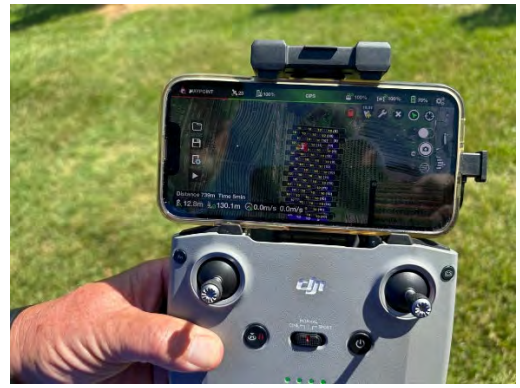
DJI drone controller with flyover map displayed on the iPhone