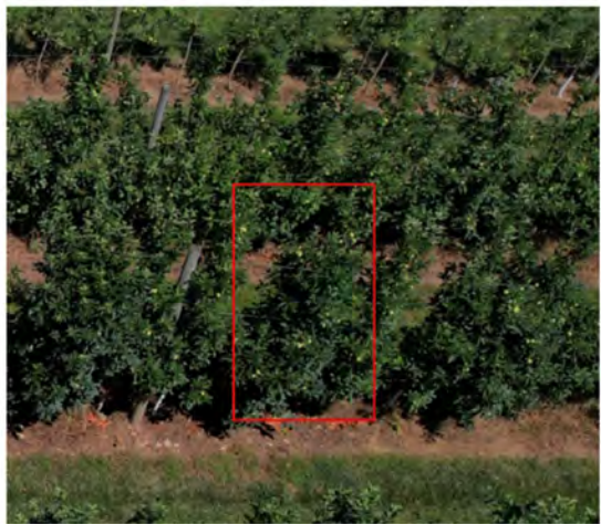
Wightmans Drone View of High Crop Load Trees