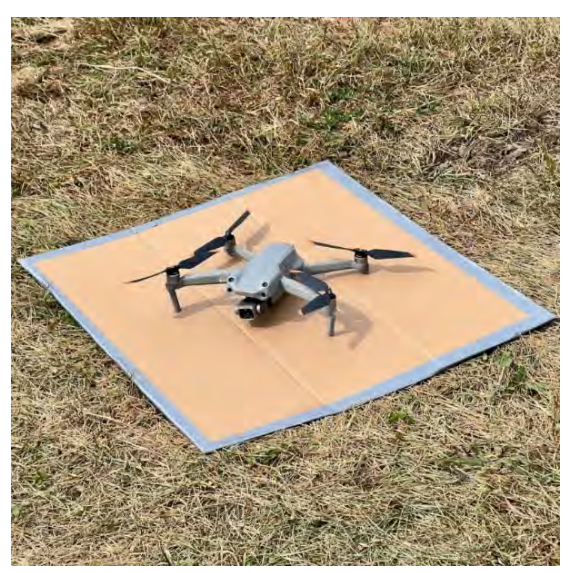
Outfield Drone