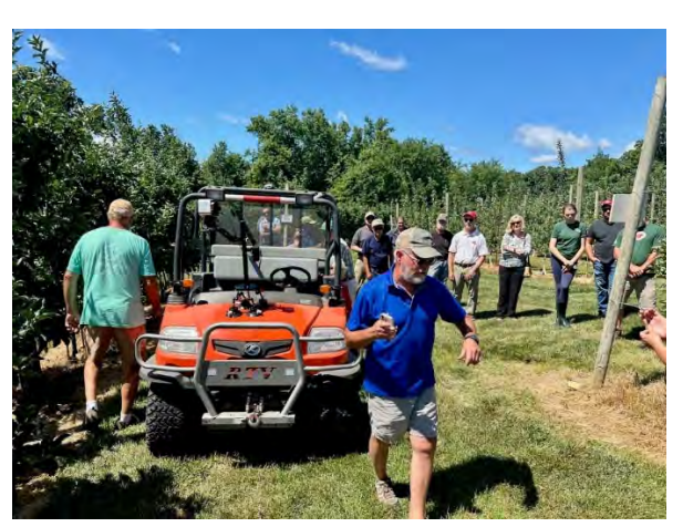
Vivid Machines (vivid-machines.com) camera mounted on the hood of the Kubota ATV.