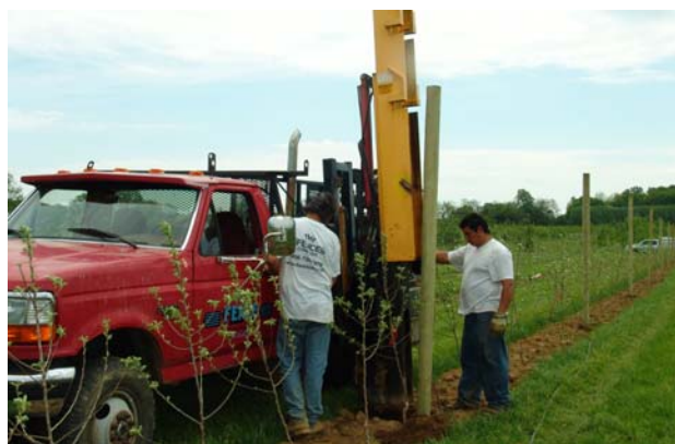
Figure 3. Post installation on May 6 in the 2010 NC-140 Apple Rootstock Trial in New Jersey. Installation was performed by The Fence Company ( www.thefenceco.com ).

trols, B.9 as the smallest tree, a small (NAKBT337) and a large (Pajam 2) clone of M.9, and M.26 EMLA.