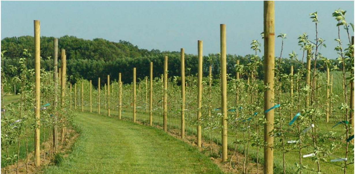
Figure 4. The 2010 NC-140 Apple Rootstock Trial on June 3, 2010 at Rutgers Clifford E. and Melda C. Snyder Research and Extension Farm, Pittstown, New Jersey.

We have a large selection of peach trees available for 2010.