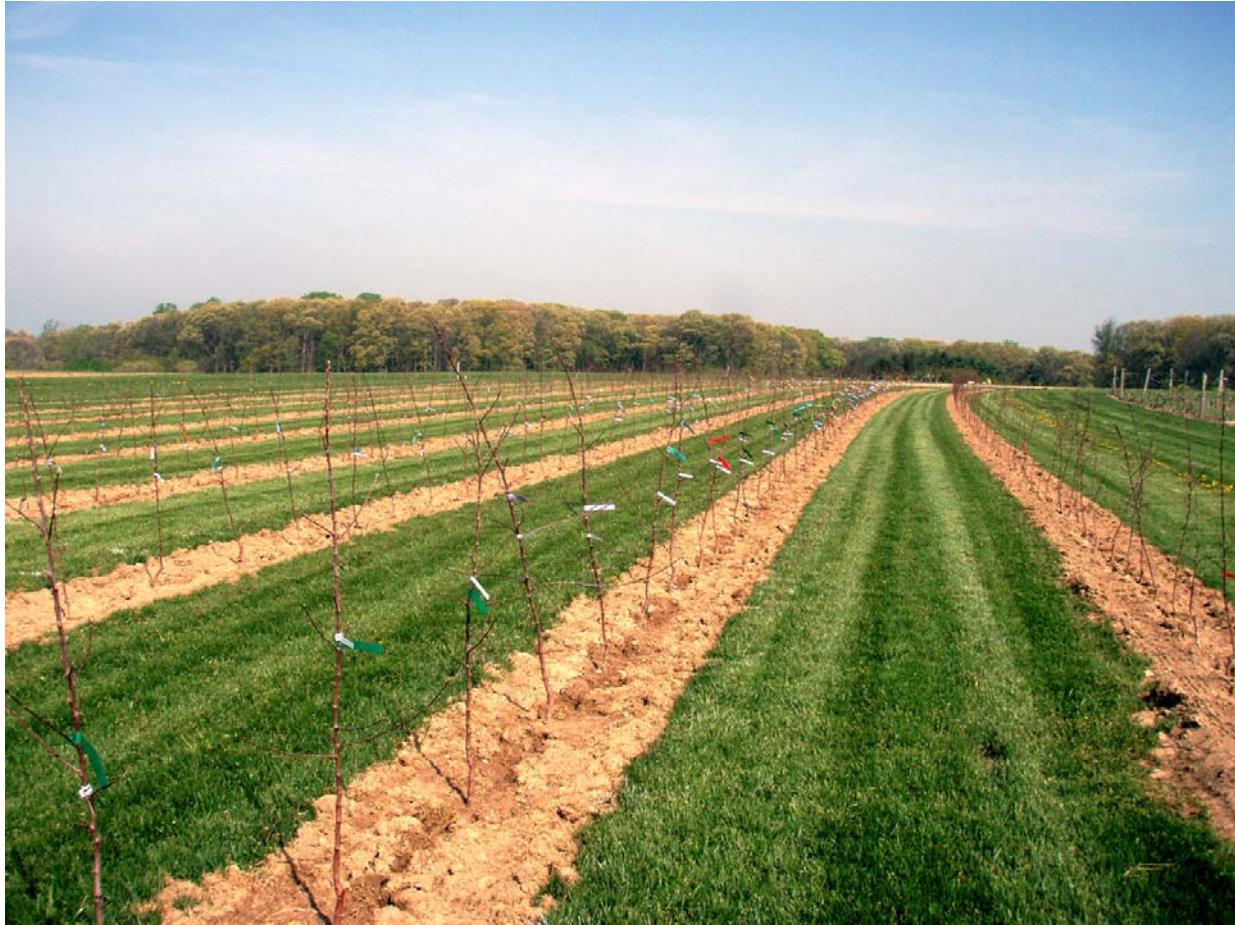
Figure 2. The 2010 NC-140 Apple Rootstock Trial on April 22, 2010, immediately after planting, at Rutgers Clifford E. and Melda C. Snyder Research and Extension Farm, Pittstown, New Jersey. Turf was established during the summer of 2009 with Turf Type tall fescue planted at 300 pounds per acre. In the spring of 2010, contour rows were laid out and herbicide strips were killed with Roundup. After planting, strips were sprayed Galery, Prowl H2O, and Solubor.