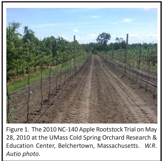
Figure 1. The 2010 NC-140 Apple Rootstock Trial on May 28, 2010 at the UMass Cold Spring Orchard Research & Education Center, Belchertown, Massachusetts.

In 2010, a new apple rootstock trial was established by the NC-140 Rootstock Research Committee at 20 sites in the United States, one in Canada, and one in Mexico. Varieties include Honeycrisp in 15 northern locations and Fuji in seven southern locations. In Massachusetts (UMass Cold Spring Orchard Research and Education Center, Belchertown, MA, Figure 1) and