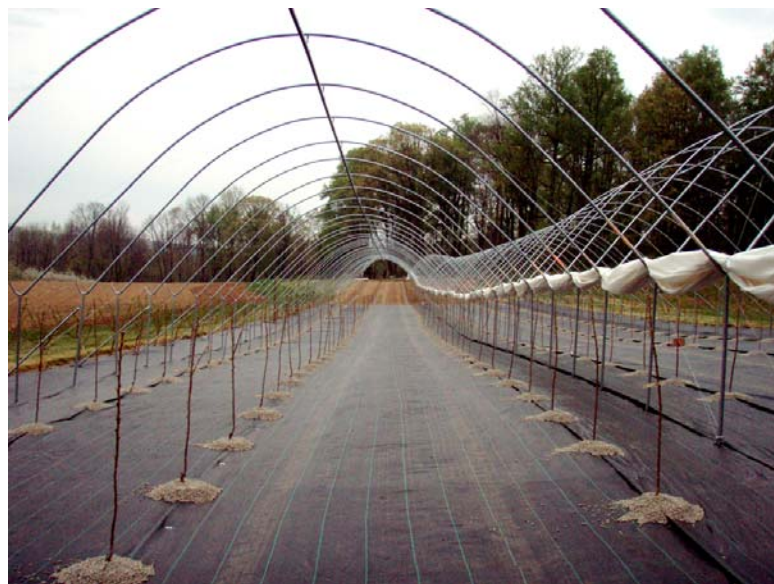
The new Haygrove tunnel planting with sweet cherry at Wightman's Farms. Sweet Cherry on Gisela 5 was planted in April 2010. The stone is to protect against rodents.

Over 28 growers attended the May 18 twilight meeting at Wightman's Farms. Wightman Farms operation encompasses 125 acres within a 3-mile radius of the farm market. The primary crops are 20 acres of apples and peaches, 40 acres of sweet corn, 45 acres of pumpkins, and the remainder in mixed vegetables and flowers. Fruit marketing focuses on PYO as well as retail sales.