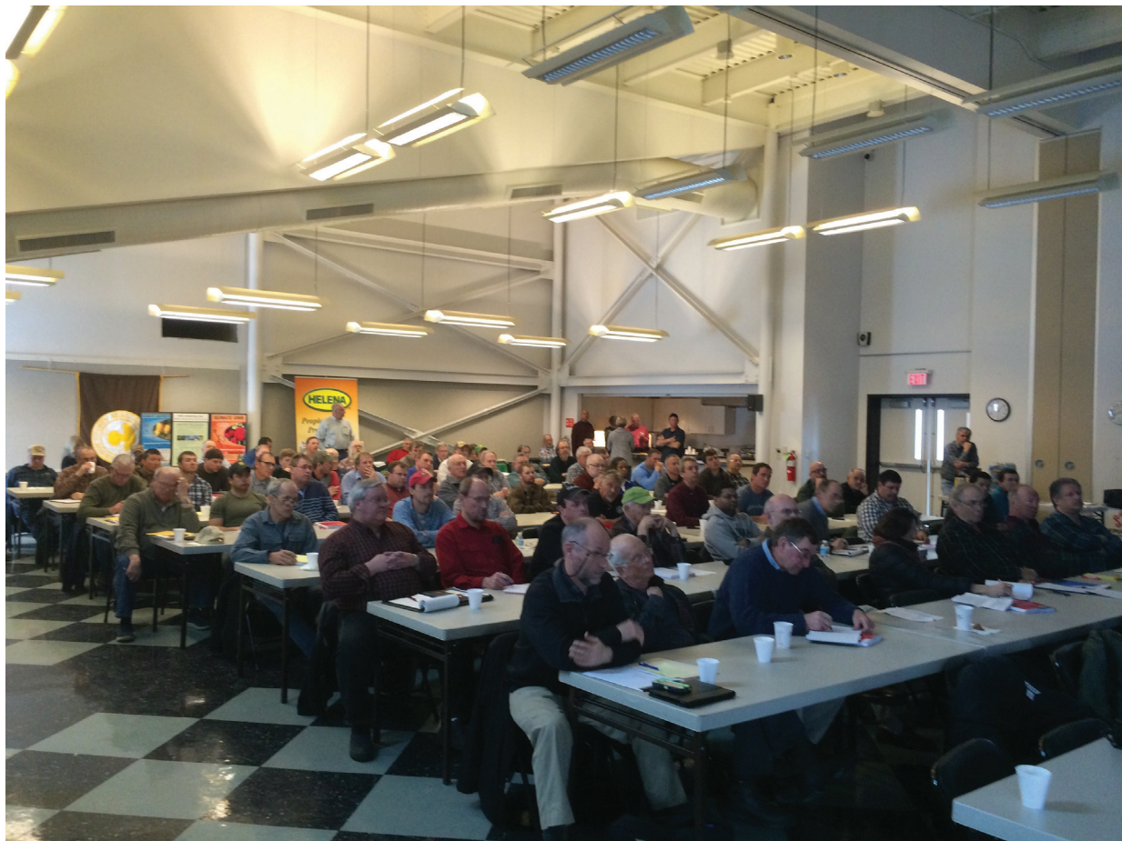
More than 100 growers attended the Seventieth North Jersey Fruit Meeting on March 4, 2015.