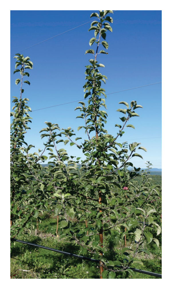
Second-leaf Macoun trees at the end of the season after receiving MaxCel at 200 ppm with an air-blast sprayer during bloom. Apex Orchards, Shelburne, Massachusetts.

B) If spraying bearing trees in second or third leaf to increase overall branching, apply MaxCel at 200 PPM using an air-blast sprayer. It is best if lower nozzles are turned off and the spray is targeted to the top 1/3 to 2/3 of the tree where more branching is desired. Time the application to apply at bloom to petal fall to cover green tissue. This rate will help remove fruit in the top 1/3 of tree, where you do not want to allow the canopy to fill out.