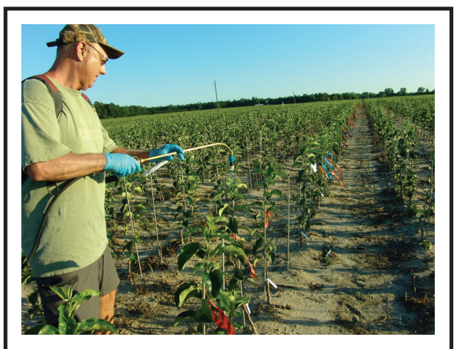
Applying MaxCel/Promalin for branching to apple trees at Adams County Nursery, Ellendale, DE USA.

A) Apples in a nursery or planted in place can be