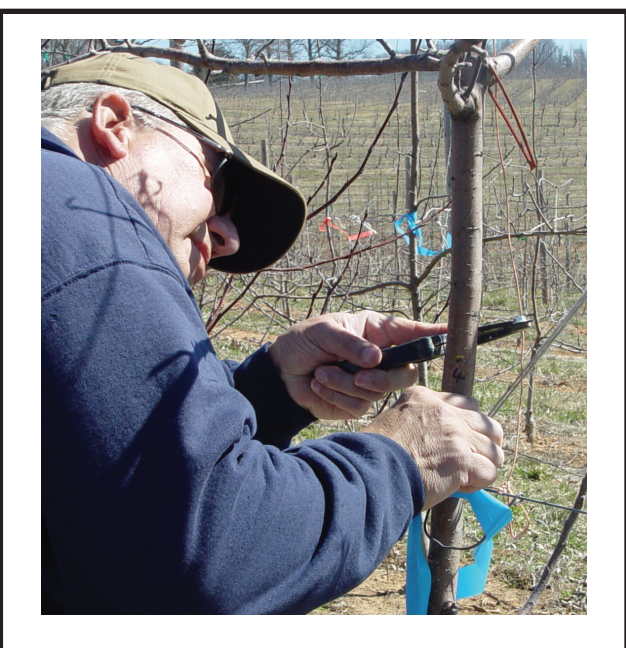
Notching blindwood in the spring before significant bud growth.