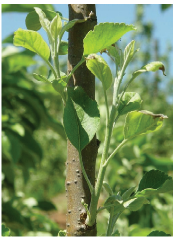
Two-year-old non-bearing Granny Smith trees with no visible buds (blind wood). Trees were notched with a hacksaw blade (narrow, fine-toothed saw, usually used for cutting metal) just above the existing bud scar on the leader, and then the cut was sprayed immediately with a 1500 PPM solution of MaxCel.

(NIS). Apply by spraying with a back-pack sprayer. Works best when temperatures are warm and there is enough tissue to absorb the PGR. Note: Never add surfactant to a solution of MaxCel as it is already included in the formulated product. Promalin should