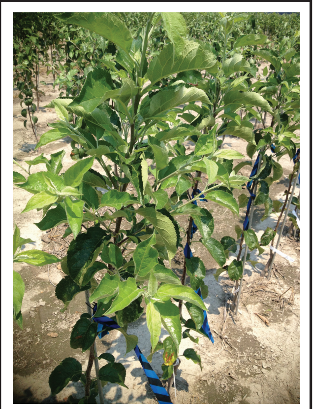
Feathers on Macoun/M.9 NAKBT337 trees with four applications of Promalin at 500 ppm to the growing tips. Adams County Nurser, Delaware.

pump manually operated back pack sprayer can be used but should have the boom modified to have a pressure regulator, and a swivel head attachment for the nozzle head (See Photo) so that the desired amount of spray can be applied to each tree. Parts are available from TeeJet Corporation and Gate Technologies. Note: A complete parts list and instructions can be obtained from the author: Win Cowgill, P.O. Box 143, Baptistown, NJ 08803 USA (wincowgill@mac.com).