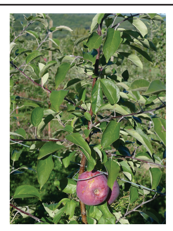
Second-leaf Cortland trees at the end of the season after receiving MaxCel at 200 ppm with an air-blast sprayer during bloom. Apex Orchards, Shelburne, Massachusetts.