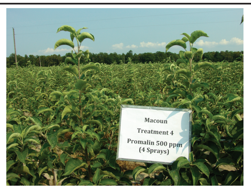
Feathers starting in treated Trees at Adams County Nursery, Delaware. Trees are Macoun/M.9 NAKBT337 and received four applications of Promalin at 500 ppm to the growing tips every 7-10 days.