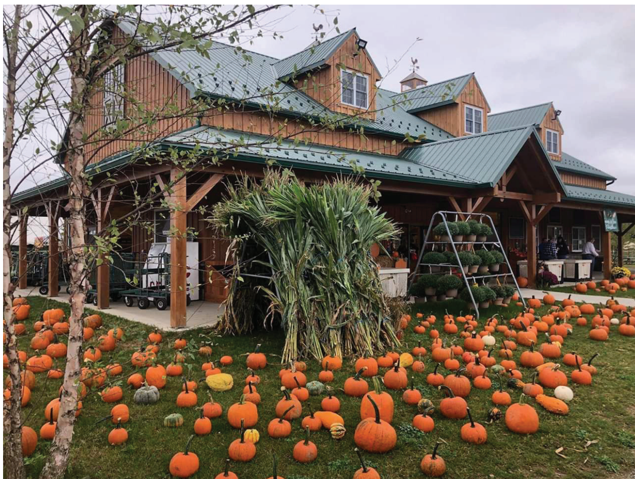
Tranquility Farms farm market ready for pumpkin sales.

Tranquillity Farms, located in Allamuchy, NJ, is home to a diverse third-generation, family-run agriculture business. Set on 600 acres and farming 800 total acres, the farm prides itself on its registered Holsteins and continual expansion of crops. We are keeping farming in New Jersey and supplying our customers with fresh, local produce! See https://www.tranquillityfarmsnj.com/about-us for more information.