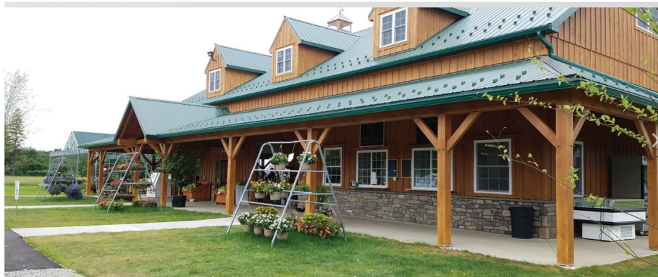
Farm Market at Tranquillity Farms, Andover, NJ.