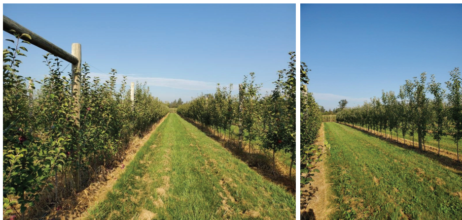
New 5-Acre Tall Spindle Apple Orchard Established in 2018-19 at Tranquillity Farms. Trees have reached the top wire at second leaf, with good fruit bud formation for first crop in 2020.